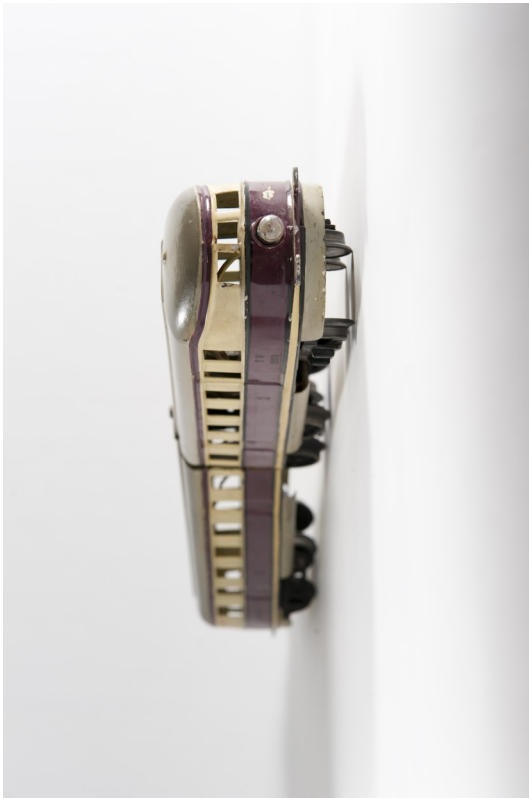
Tin plate mechanical train, HT 2009-1621