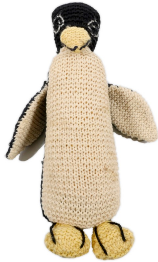
Toy penguin, HT 2016-1336