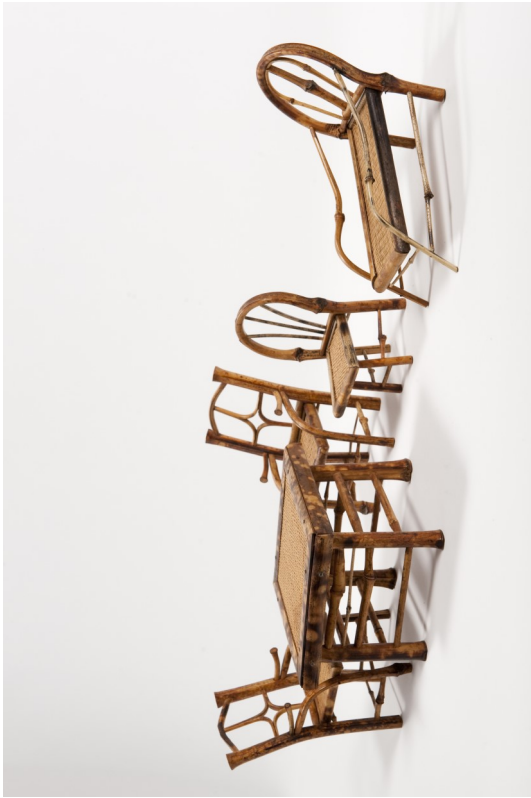
Chinese miniature furniture, HT 2007-677 a-e