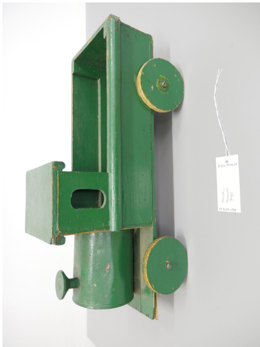
Toy truck, HT 2020-0919