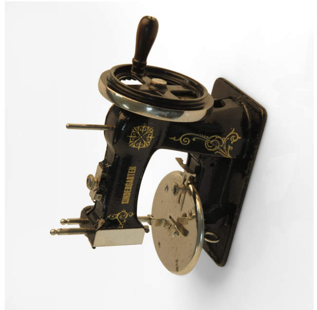
Toy sewing machine, HT 87-877